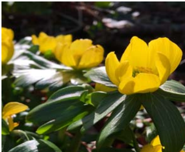
Winter aconites in flower