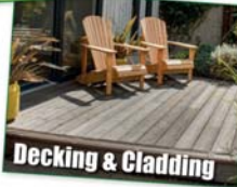
Decking & Cladding